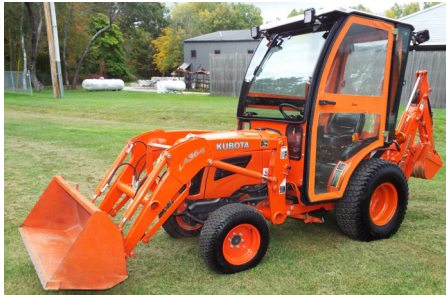
2004 Kubota B2620 (300 Hrs.)

ESTATES • ANTIQUES & COLLECTIBLES CONSIGNMENTS • SPECIAL COLLECTIONS