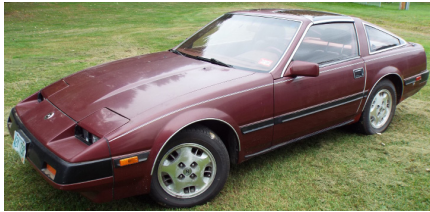
1984 Nissan 300ZX